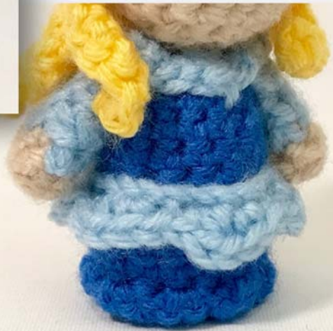
Two Hearts Crochet