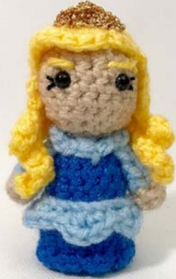
Two Hearts Crochet