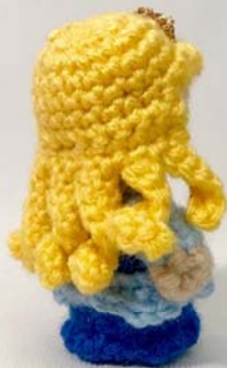
Two Hearts Crochet