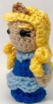
Two Hearts Crochet