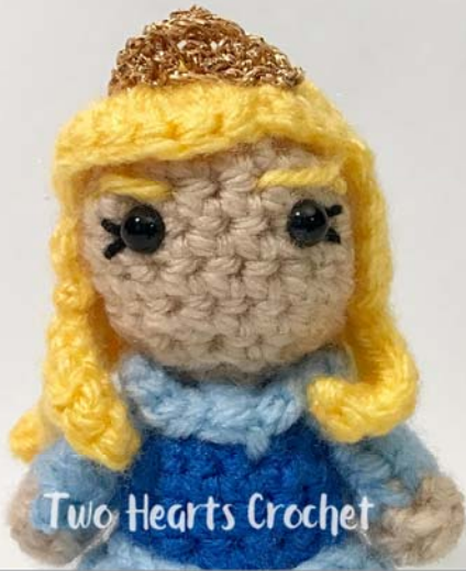
Two Hearts Crochet