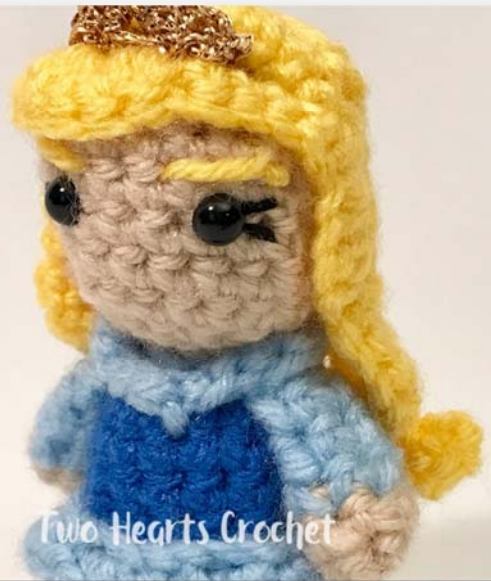
Two Hearts Crochet