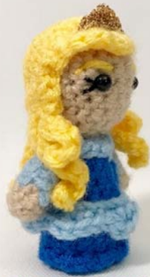
Two Hearts Crochet